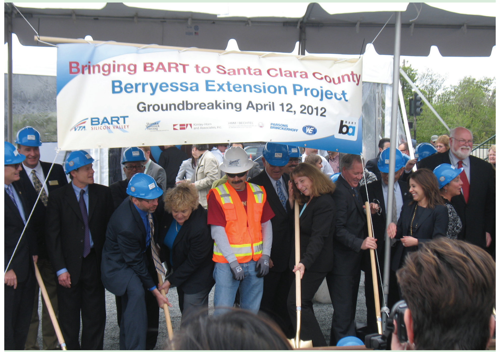
Federal, state and local officials shoveling ballast (rock) at the BART Silicon Valley Berryessa Extension Project Groundbreaking, Thursday, April 12, 2012.